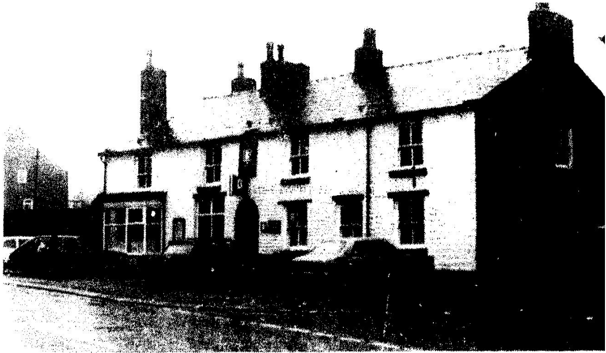
VOLUNTEER, BROMLEY CROSS

The introduction of Duttons bitter had reached the Volunteer and Sportsmans Arms on Darwen Road, Bromley Cross and the Cheetham Arms (now Brewhouse) Blackburn Road.